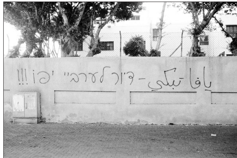
Graffiti in the gentrified Ajami neighborhood: "Jaffa Weeps [Arabic] – Housing for the Jaffa Arabs!!! [Hebrew]."

Such moments of collective action mark a shift from a liberal discourse of "coexistence" to an assertive claim for political entitlement and "collective existence" ( Kiyan ). The housing problem thus encapsulates a claim over the historicity of the city as well as a dire need for practical housing solutions for low-income families. Although Palestinian communal mobilization has been increasingly visible since the October 2000 Events and Al-Aqsa Intifada , it is no match for market forces that promote the Judaization of the city. The recent emergence of gated communities in Jaffa signals new modes of urban exclusion that reshape previous forms of spatial distinction. Reviving previous traumas of displacement, gentrification reshuffles communal and spatial boundaries, further destabilizing Palestinians' sense of belonging. In 2007, the threat of "urban removal" disguised as "urban renewal" reached a new level when the Israel