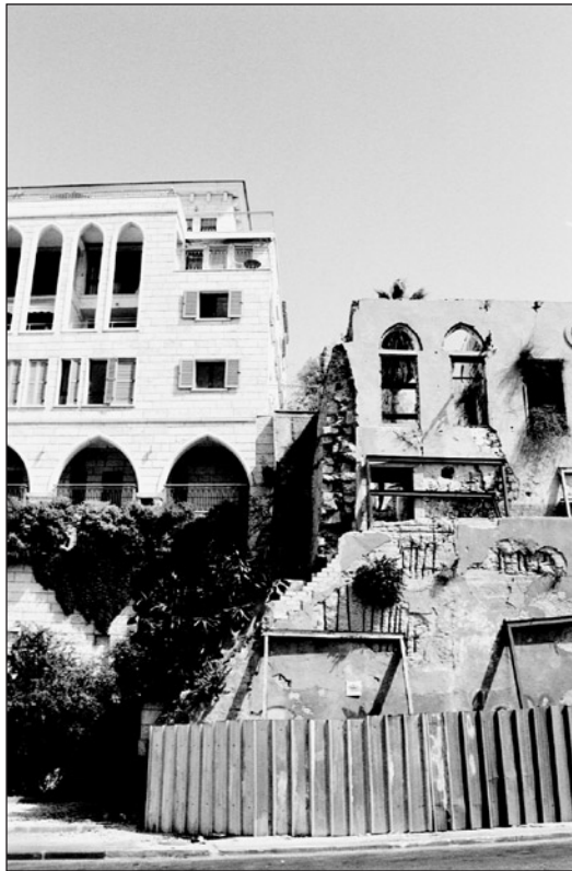
Predatory gentrification in the New-Old Jaffa: The Andromeda Hill gated community next to a soon-to-be-demolished Arab house.